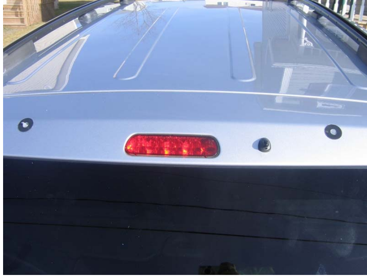
Third brake light