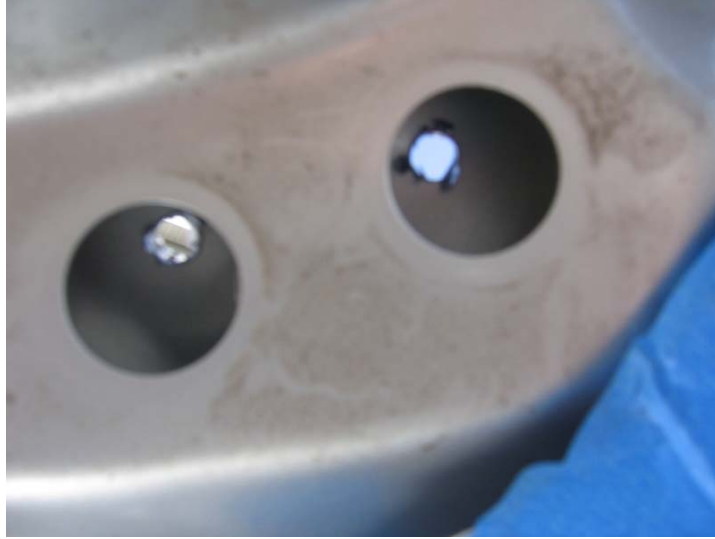
View from inside the hatch passenger side