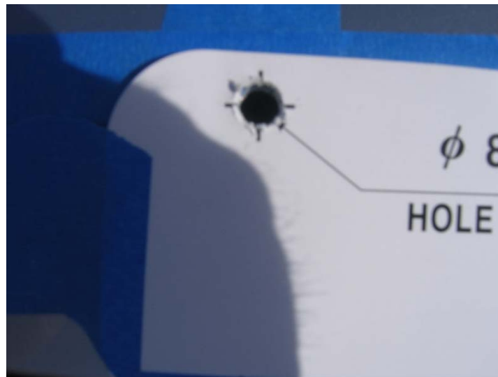
Left side of the Third brake light