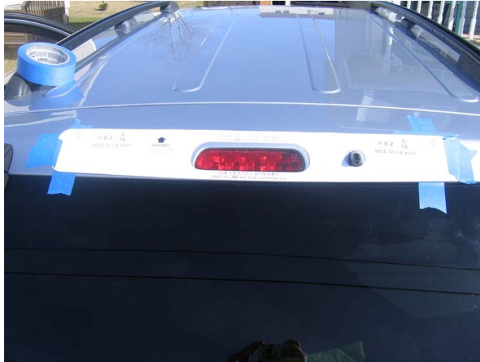
Third Brake light